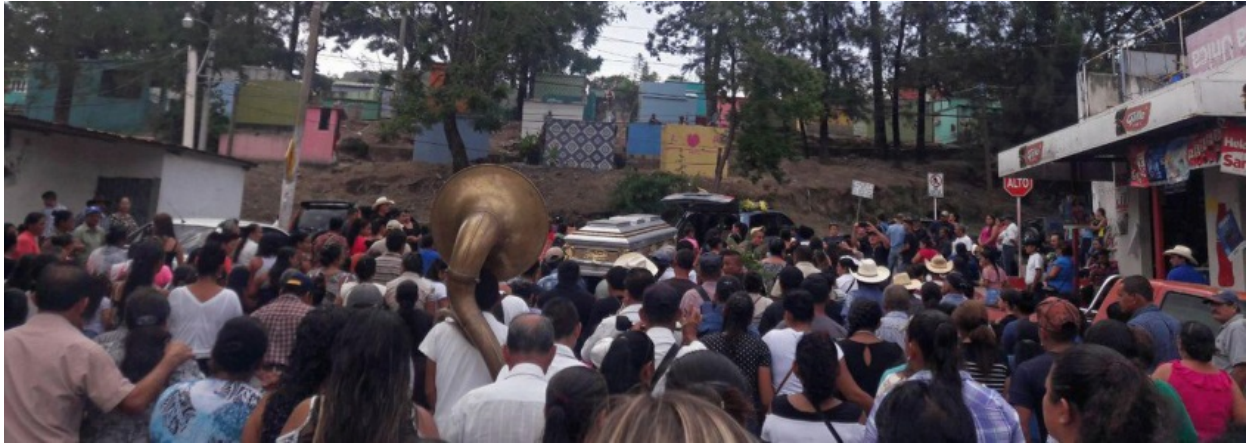
Figure 1 24

the criminalization and detention of its leaders and Tahoe's denial of the existence of Xinka people.