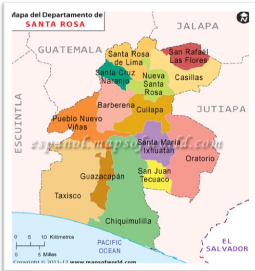
Figure 3 Municipalities in Santa Rosa