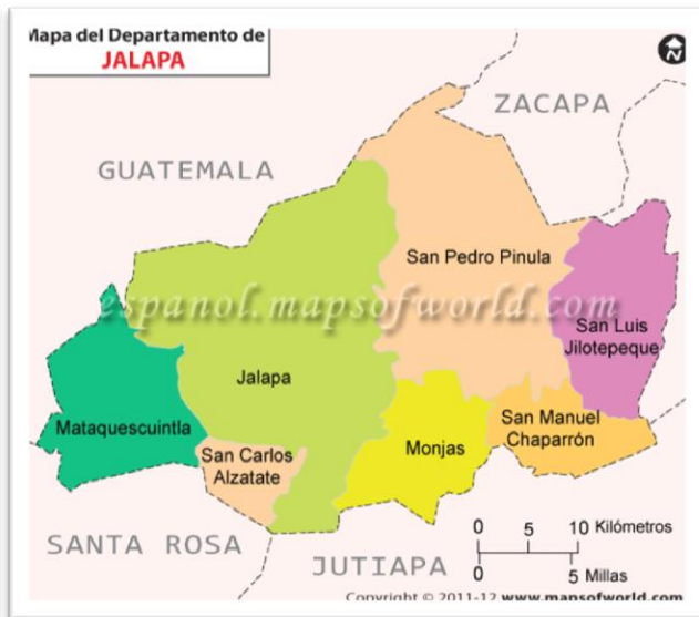
Figure 4 Municipalities in Jalapa

In conclusion, Tahoe has not disclosed that both MSR and supporters of mining have brought lawsuits to prevent people from voting or invalidating the results of unfavourable results. Tahoe argued in December 2015, that the degree of community support should be determined by the numbers of mayors receiving royalties – Tahoe said that 7 out of 9 municipalities were accepting the royalty payments. Yet Tahoe had information that four months earlier, a series of elections in the region had resulted in the election of mayors who rejected the royalties. In short, Tahoe had information about its lack of support, but did not disclose it.